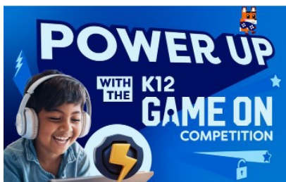
Game On Competition

Stay tuned for so much more coming soon! Explore the College Prep Center now!